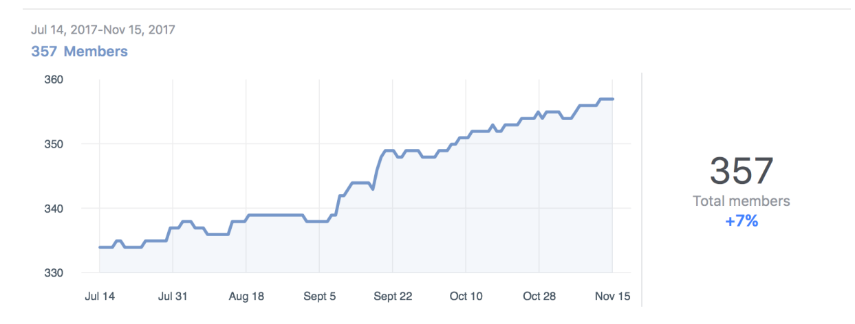
Figure 2 Growth Details Jul - Nov 2017