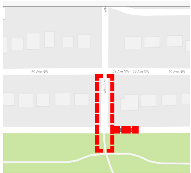
Location 2: 97 Street, south of 69 Avenue