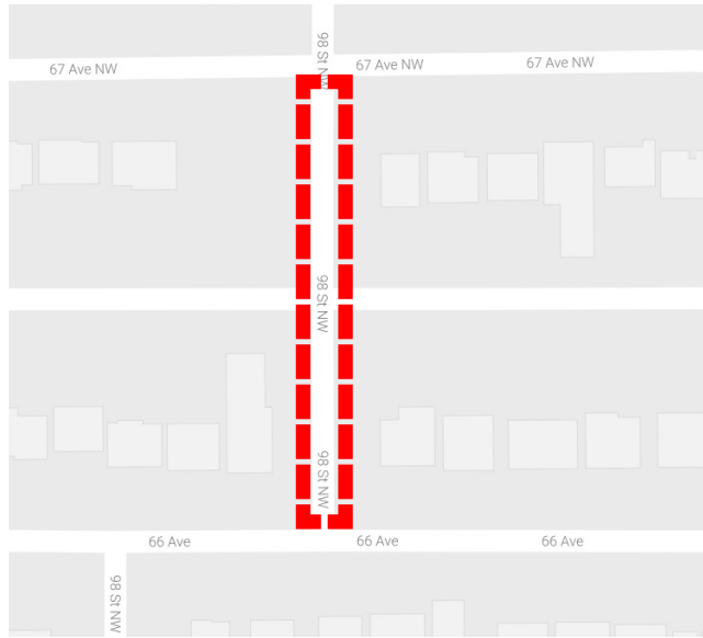
Location 1: 98 Street between 67 Avenue & 66 Avenue