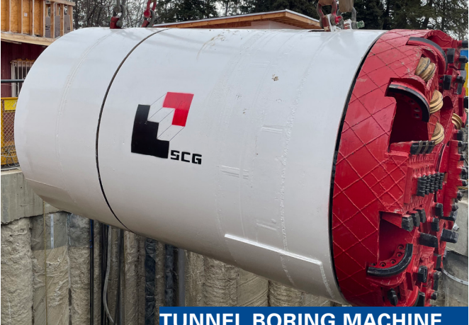
TUNNEL BORING MACHINE

Upon completion of the tunnel, the TBM will be extracted. The shaft will then be converted to a